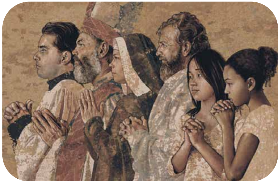
Communion and Liberation

If you have questions about how to designate the Hartford Catholic Worker in your will or retirement account consult your financial adviser and check out this helpful website https://trustandwill.com/learn/charity-as-a-beneficiary