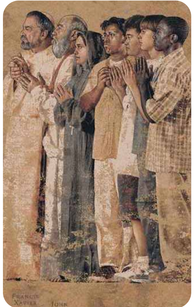
Communion of Saints

age. Soon strangers were writing to us, calling us, visiting us, and supporting our work with gifts of time, talent, and treasure. For many years we gave talks once or twice a week at